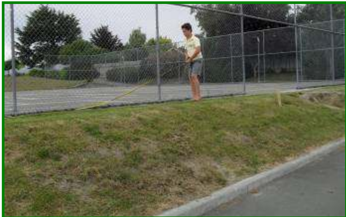
The bank prior to R13 students planting