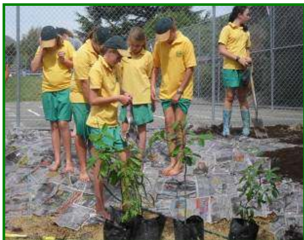
R13 students busy preparing and planting the bank