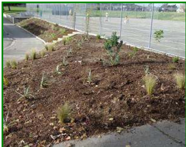
The bank planted out by R13 students